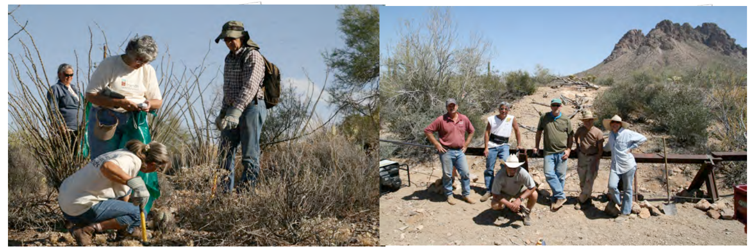
Volunteers are a critical part of Friends of Ironwood Forest. Projects like the removal of buffelgrass (above left) and restoration of illegally created roads to protect wildlife like Big Horn sheep (above right) make a real difference on the ground. Past projects have been successful due to partnerships formed with other organizations like the Big Horn Sheep Society, Native Plant Society, Bureau of Land Management, Unitarian Universalist Church of NW Tucson, and others!