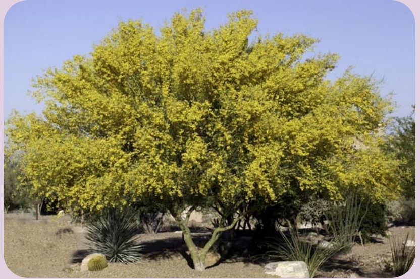
Hybridized palo verde, known as the Desert Museum variety, in full bloom.

Palo verde trees have soft wood of little use except as firewood. They grow fast but rarely exceed 100 years old (BPV) or slightly older in the FPL. They