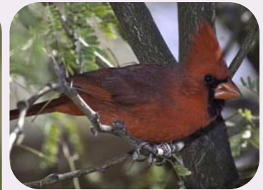
from left: Pyrrhuloxia and cardinal . below: Phainopepla . © Young Cage

Both newcomers and visitors to southern Arizona are often surprised to see Northern Cardinals ( Cardinalis cardinalis ) flying about in our desert. They seem out of place without the deep green forest foliage of the north and east United States. Yet they thrive here, and are always a beautiful sight to see as they move about the Mesquites, Ironwoods, and even Cacti. While they may not be the state bird, (an honor reserved for the Cactus Wren) they are likely still our most recognizable bird and even have a sports franchise named after them (the Arizona Cardinals).