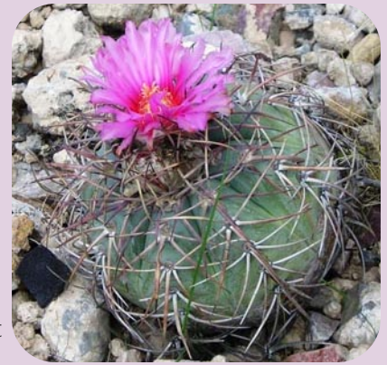
Endangered Nichol Turk's Head cactus.