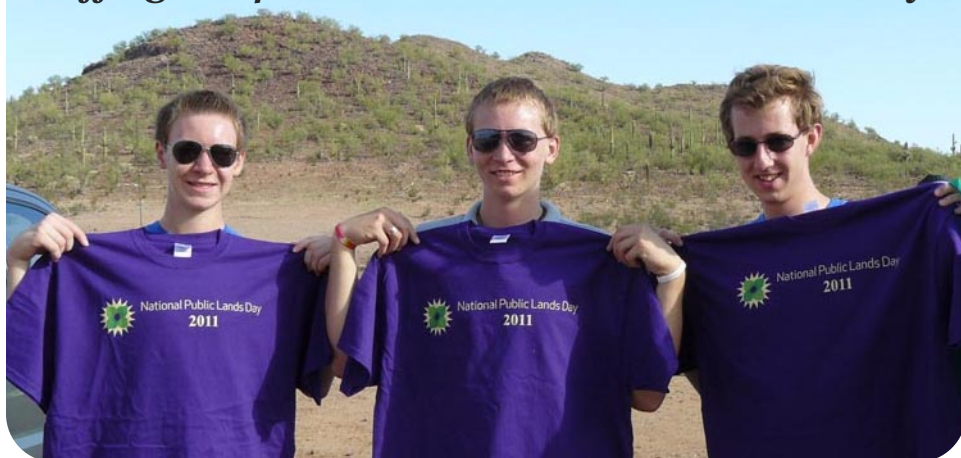
Future advocates for America's public lands from Marana High.

Thank you to everyone who participated in the buffelgrass pull on National Public Lands Day!