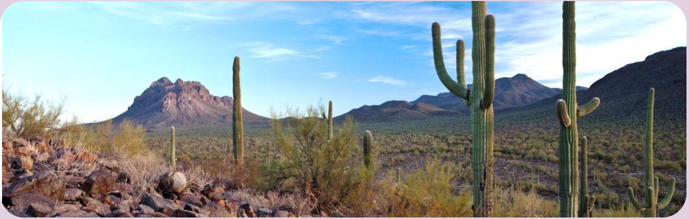
Ragged Top and Silverbell Mountains.