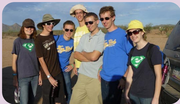
A great group of Marana High School students participated in National Public Lands Day, September 24, 2011.