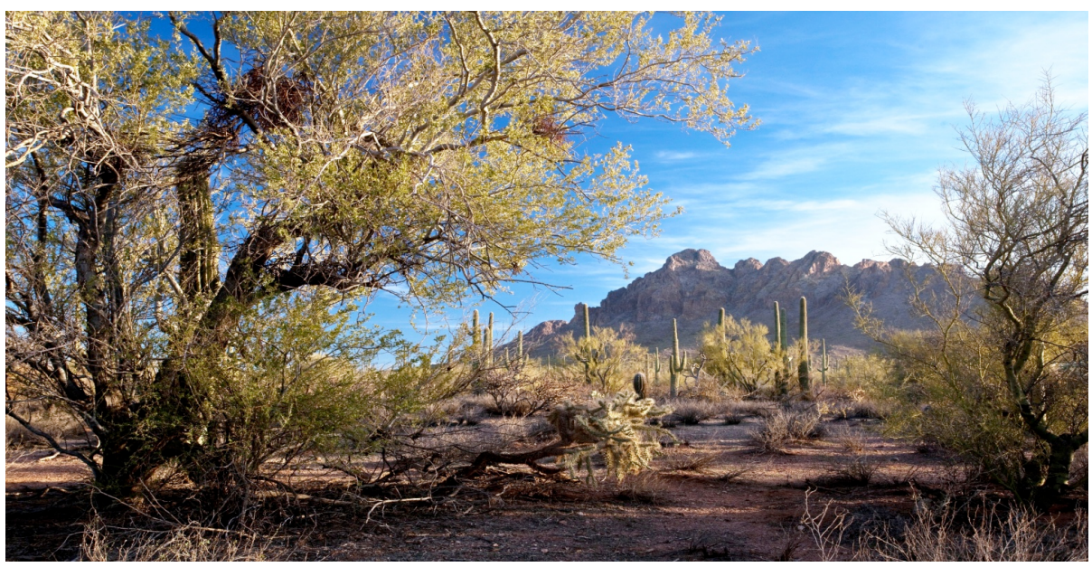
Ironwood Forest National Monument, Arizona, View of Ragged Top Bureau of Land Management, www.blm.gov/nlcs

Friends of Ironwood Forest works for the permanent protection of the biological, geological, archaeological, and historical resources and values for which the Ironwood Forest National Monument was established through education, community outreach, service projects, and advocacy.