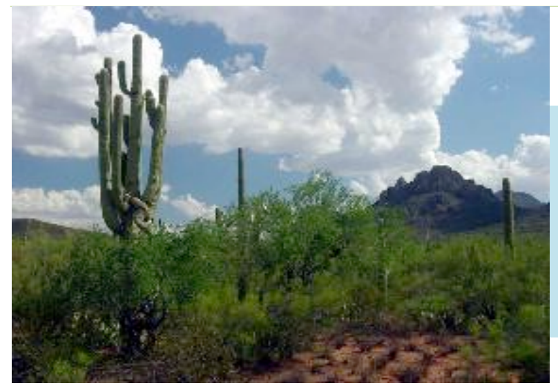
The Arizona State Museum has an on-line exhibit of the history of the Silver Bell Mining Complex. Funding for this exhibit was provided by the Bureau of Land Management as part of the Vignettes in Time Collection.

http://www.statemuseum.arizona.edu/exhibits /blm_vignettes/projects_silverbell.shtml