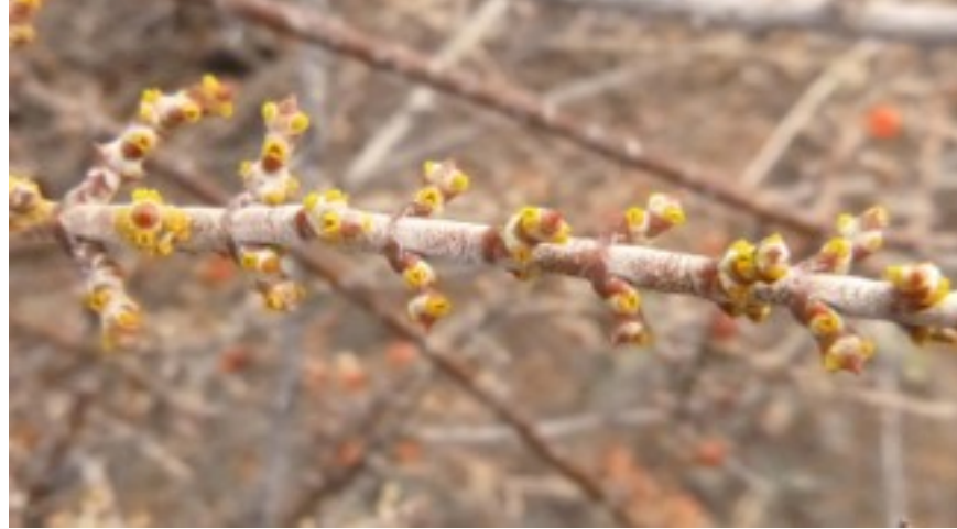
Mistletoe plants flower early in winter.

mistletoe's presence. Stealing resources from its host tree, mistletoe is able to flower early in winter when few other plants can. Thus it provides a critical food resource for many pollinators. In dry winters, locally raised honeybees provision their nests almost entirely with desert mistletoe pollen. Without the pollen and nectar provided by mistletoe many of our native pollinators, such as syrphid flies and solitary bees, would also suffer.