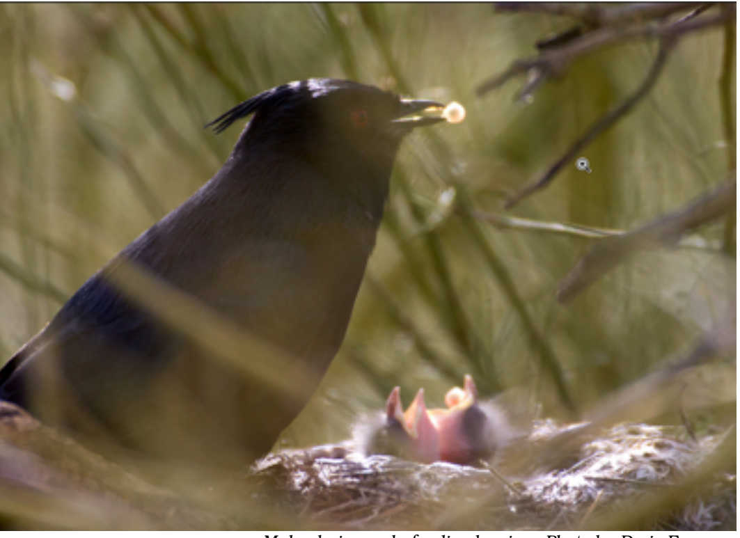
Male phainopepla feeding berries.

Many insects and mammals, including cattle, feed on the green foliage of desert mistletoe, and the beautiful great purple hairstreak butterfly