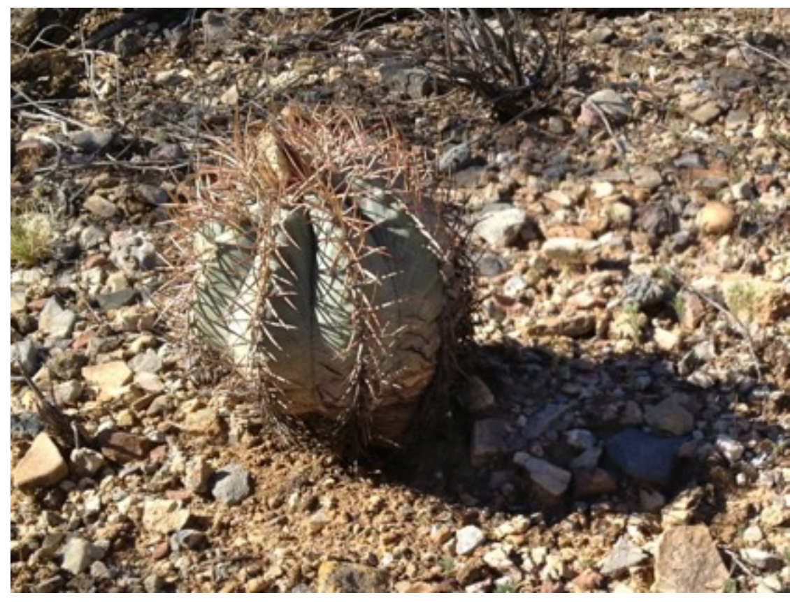
Nichol's Turk's head cactus.

few areas where its range overlaps with the fishhook barrel cactus. Fire barrel is the common barrel cactus in the Phoenix area. Like the fishhook barrel, it can reach six feet or more in height. It ranges across central, western, and southwestern Arizona into southern California, southern Nevada, southern Utah, and south into Mexico.