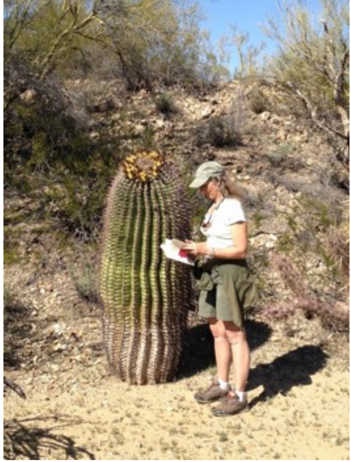
Large fishhook barrel cactus.

The Waterman Mountains, for example, are the only location in Arizona where the ranges of three of the state's five indigenous barrel cacti overlap. One of these is an endangered species.