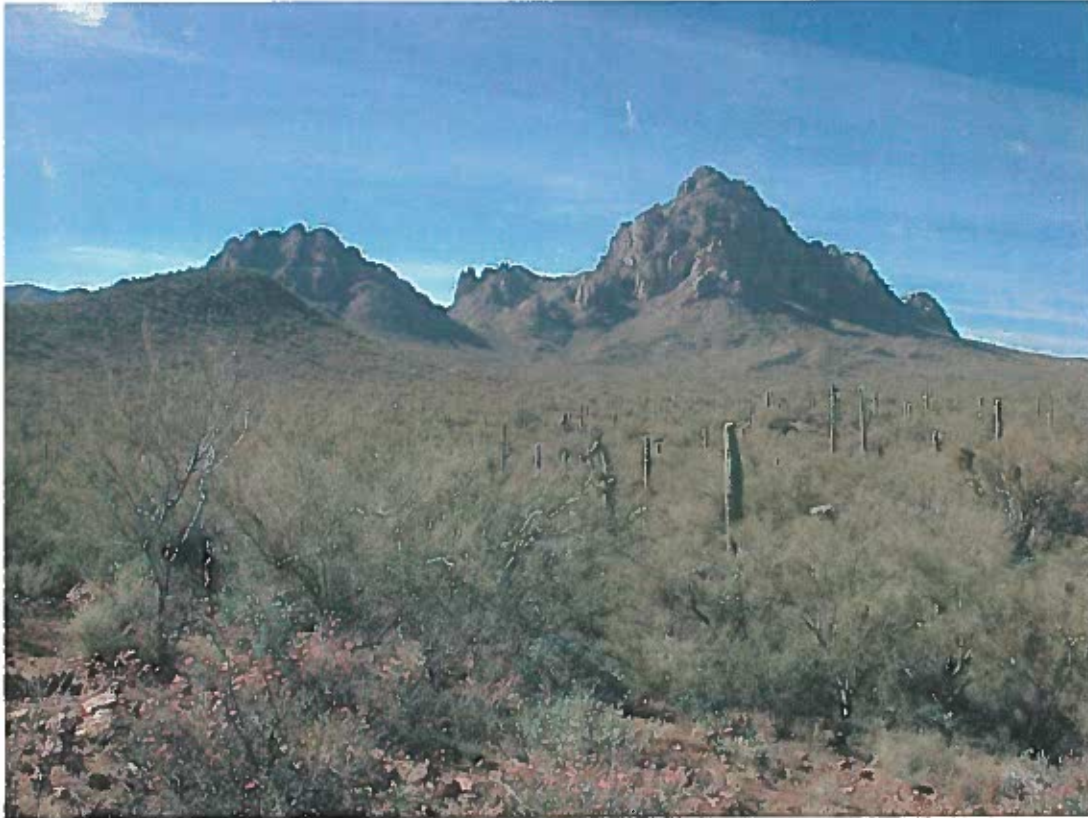
Ragged Top Mountain, Ironwood Forest National Monument