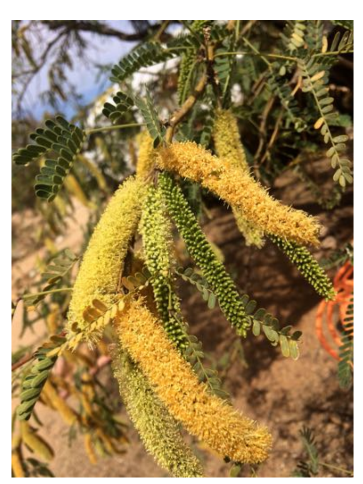
Mesquite in bloom

So. goodbye old friend. You are gone but not forgotten. For every day of your abbreviated life, you made your little piece of the world a better place, without receiving one drop of water not provided by nature. We will honor your memory by planting at least two trees.