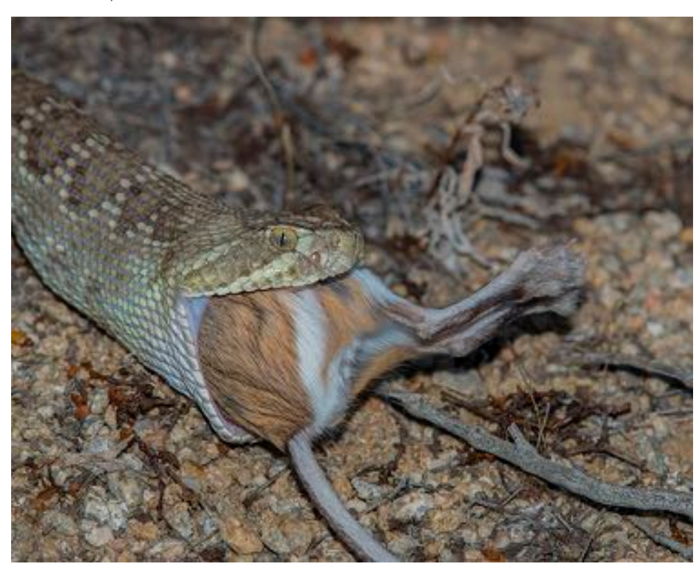
Mohave rattlesnake with kangaroo rat prey

But rather than being afraid, be informed! Rattlesnakes are part of living and playing in southern Arizona. They want nothing to do with us, but we must be alert and smart about where we reach and step. The occasional rattlesnake encounter should be fun and exciting; take some cool pictures from a safe distance and then leave the snake alone. They are fascinating and important members of the natural community in Ironwood Forest National Monument.